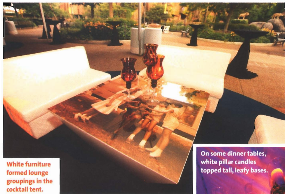
White furniture formed lounge groupings in the cocktail tent.