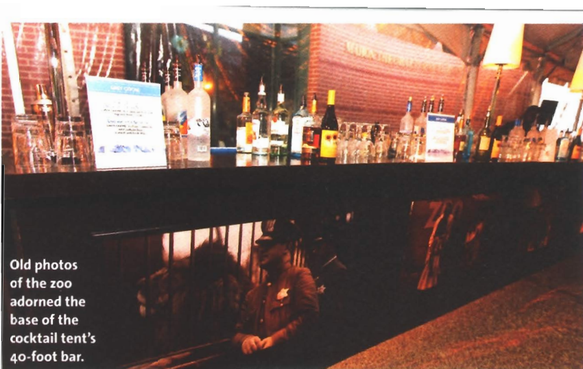
Old photos of the zoo adorned the base of the cocktail tent's 40-foot bar.